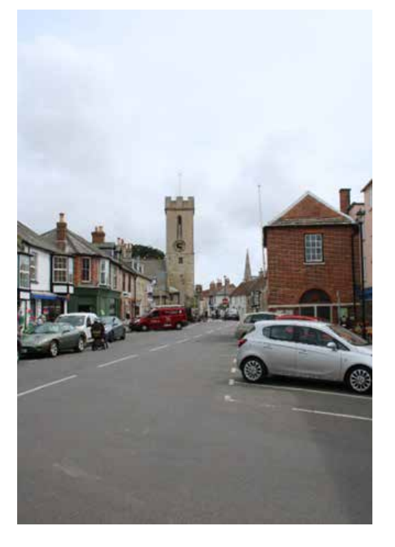
Figure 6: Example of important view looking south from Pier Street