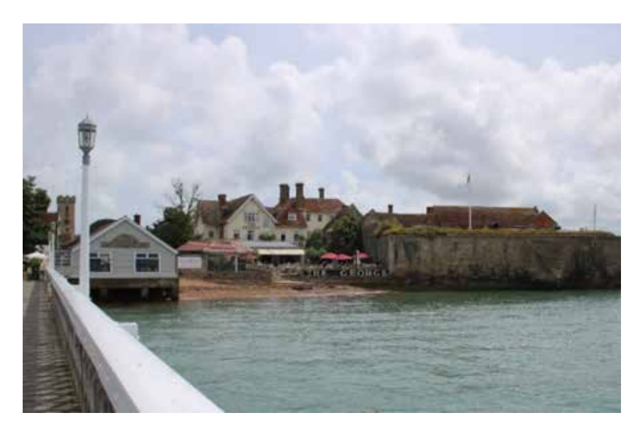
Fig 3: Yarmouth Castle and The George from the pier

5.8 17th century prosperity and significance is represented by The George, one of the most important surviving secular buildings in the town and which is particularly visually prominent in approaches from the Solent. The Towers (formerly Stephens) in the High Street