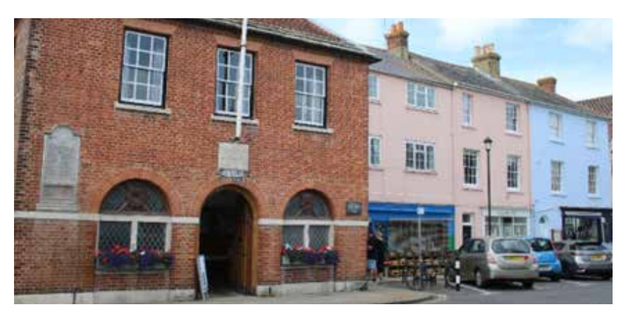
Figure 2: The town Hall with Pier Street to the right

<sup>1</sup>It became the Royal Solent Yacht Club in 1947