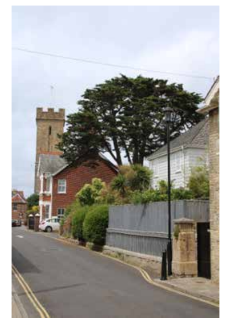
Figure 5: The striking tree in St James' Street with the church tower beyond