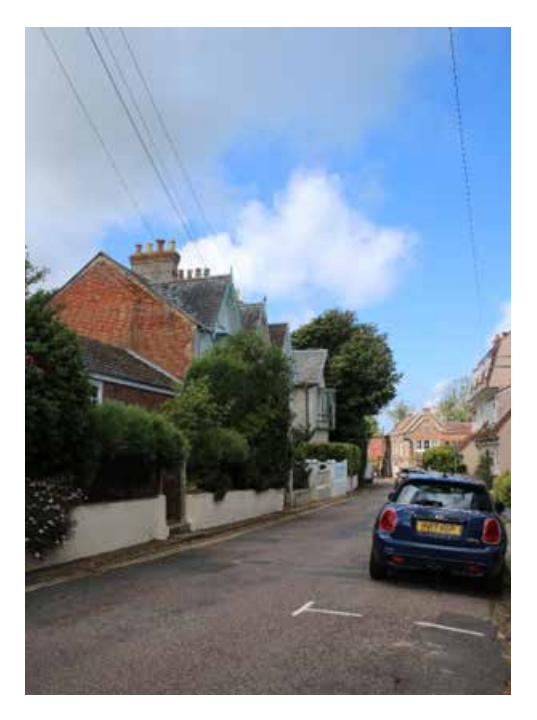
Figure 7: Character Area 1 looking west along eastern section of the High Street