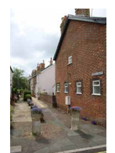
Figure 10: Alma Place – attractive planting can't disguise the patchwork nature of the surfaces