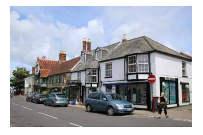
Figure 8: Character Area 2 east side of Market Square at the junction with High Street

dormer windows and first floor bay windows are present but do not dominate. There are also several nicely proportioned timber entrance doors with timber doorcases or lead covered bracketed hoods