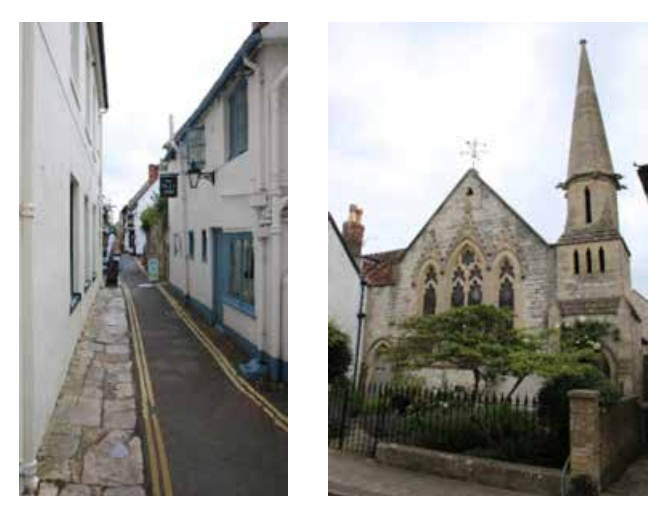
Figure 9: positive features paving and railings