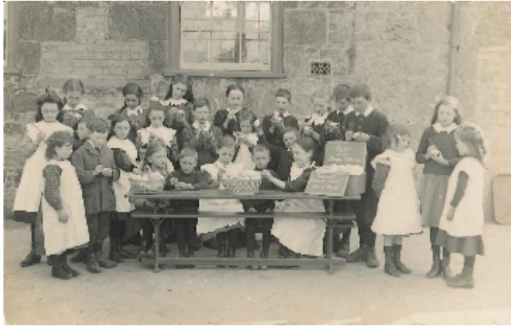
Children at Godshill Council School painting text on eggs for soldiers at the front (Postcard Ref: GDL/PCA/180)