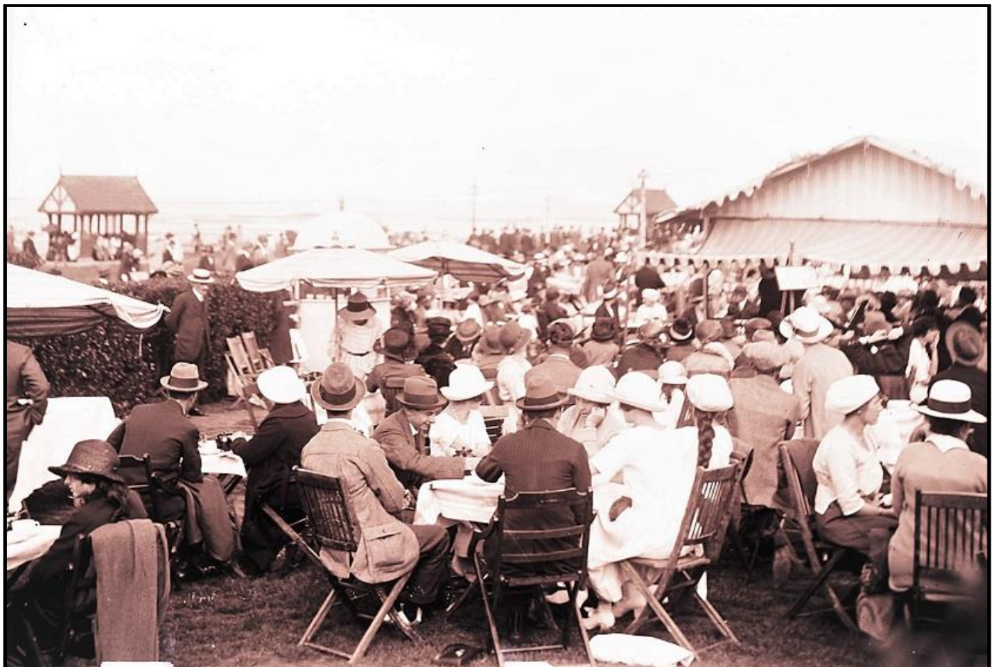
Ryde Esplanade. One of the deckchairs has 'Borough of Ryde' written on the reverse. Circa. 1920s.