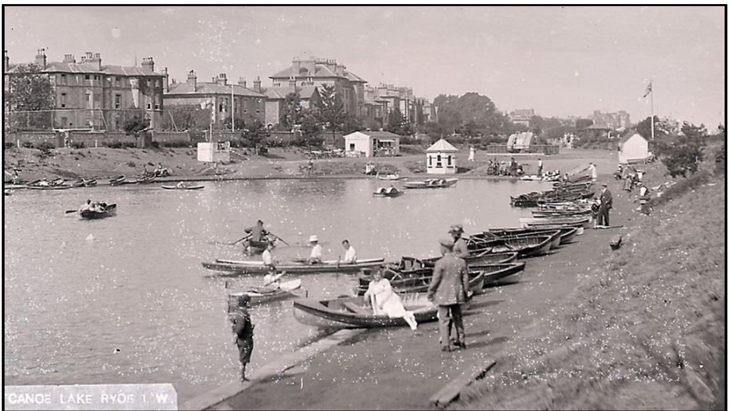
CANOE LAKE RYDE I W