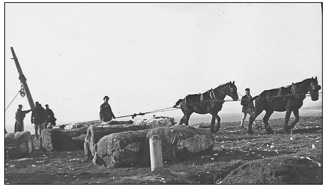
Eider. A team of cart horses with a hoist are lifting large cotton bales from the Eider to the top of the cliff during salvage operations. IWCMS.2009.60