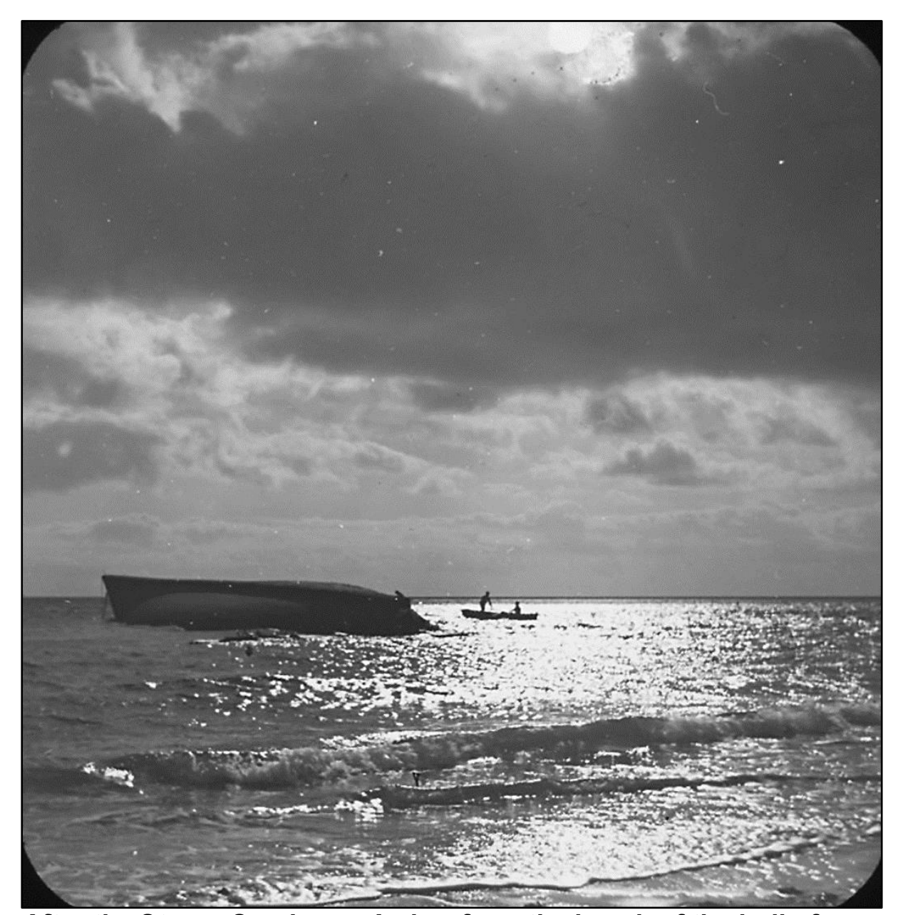
After the Storm, Sandown. A view from the beach of the hull of a boat upturned in the water. To the right of the hull is a small boat with two people aboard. IWCMS.2009.23

The J.B. Williamson Collection is a collection of images of Island shipwrecks and lifeboats that was donated to the Isle of Wight Heritage Service.