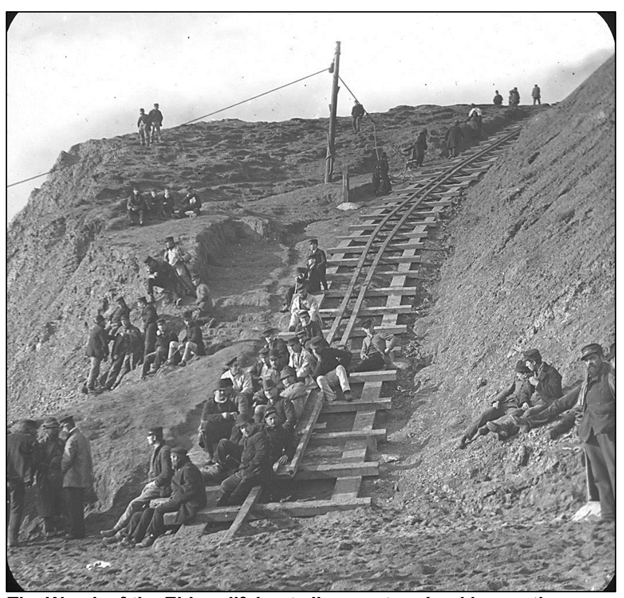
The Wreck of the Eider - lifeboat slipway at .... Looking up the slipway built to get the lifeboat from the cliff onto the beach. IWCMS.2009.67