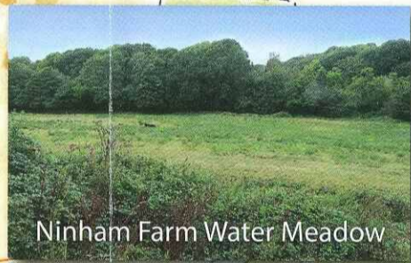
Ninham Farm Water Meadow