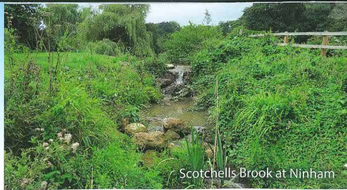
Scotchells Brook at Ninham

Follow the path down through the trees, across the bridge and straight across the meadow. Cross the footbridge over a tributary of Scotchells Brook, through a small copse and into a meadow with airport buildings in the distance. Follow the left edge of the meadow on a distinct path. Shortly before reaching a gate a path crosses by a waymark post. Turn left (9). Follow the path over a stile, through a marshy area and then a bridge over Scotchells Brook. Take the stony path with bushes on the left. This leads to the main road (10).