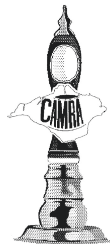
IW Branch CAMRA