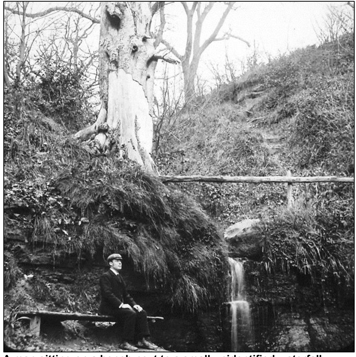
A man sitting on a bench next to a small unidentified waterfall. IWCMS.2012.38