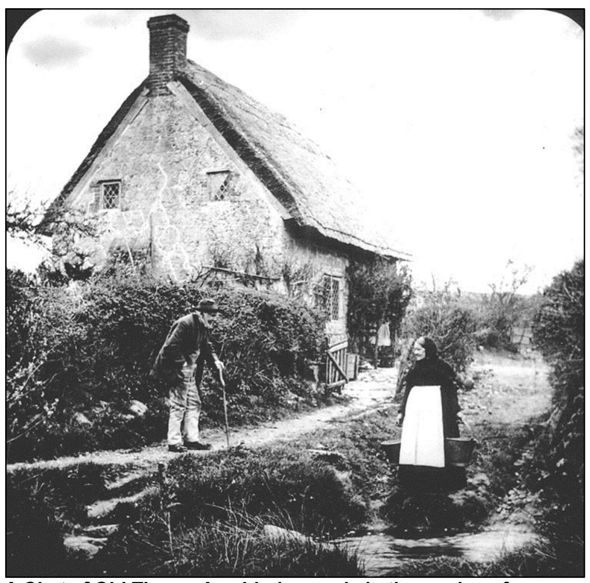
A Chat of Old Times. An elderly couple in the garden of a thatched cottage. The woman is holding two buckets she has filled from a pond whilst the man looks on from the path. 1892 IWCMS.2012.550