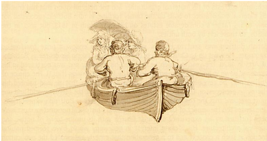
Portsmouth. Thomas Rowlandson