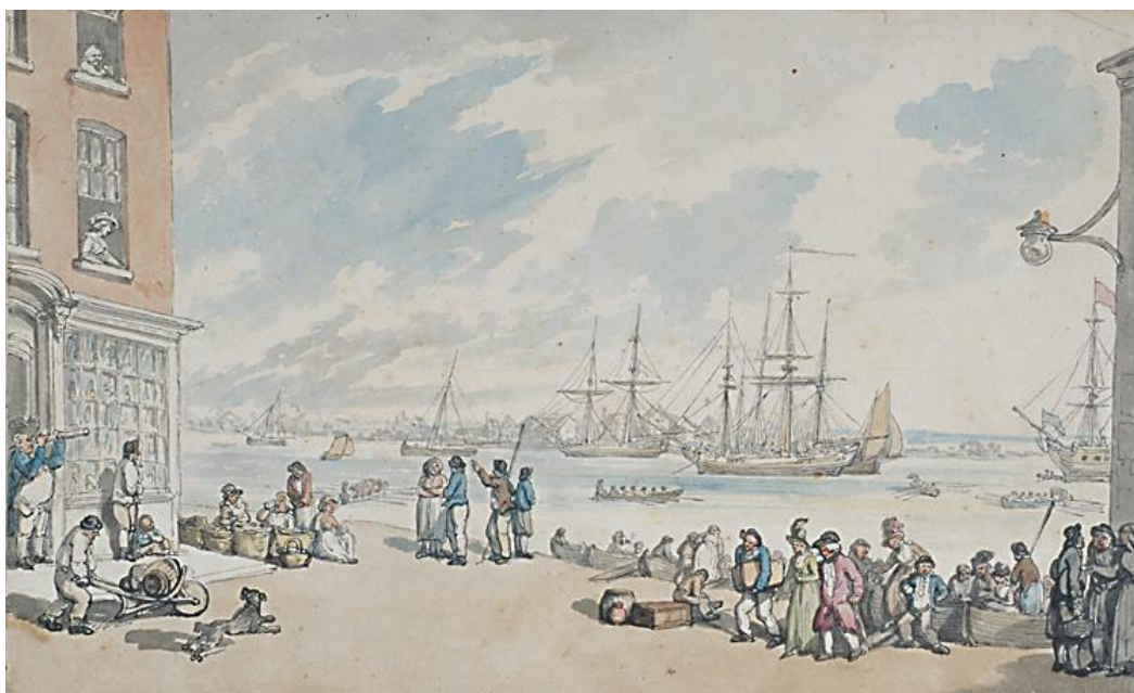
Portsmouth Point with Gosport in the distance.