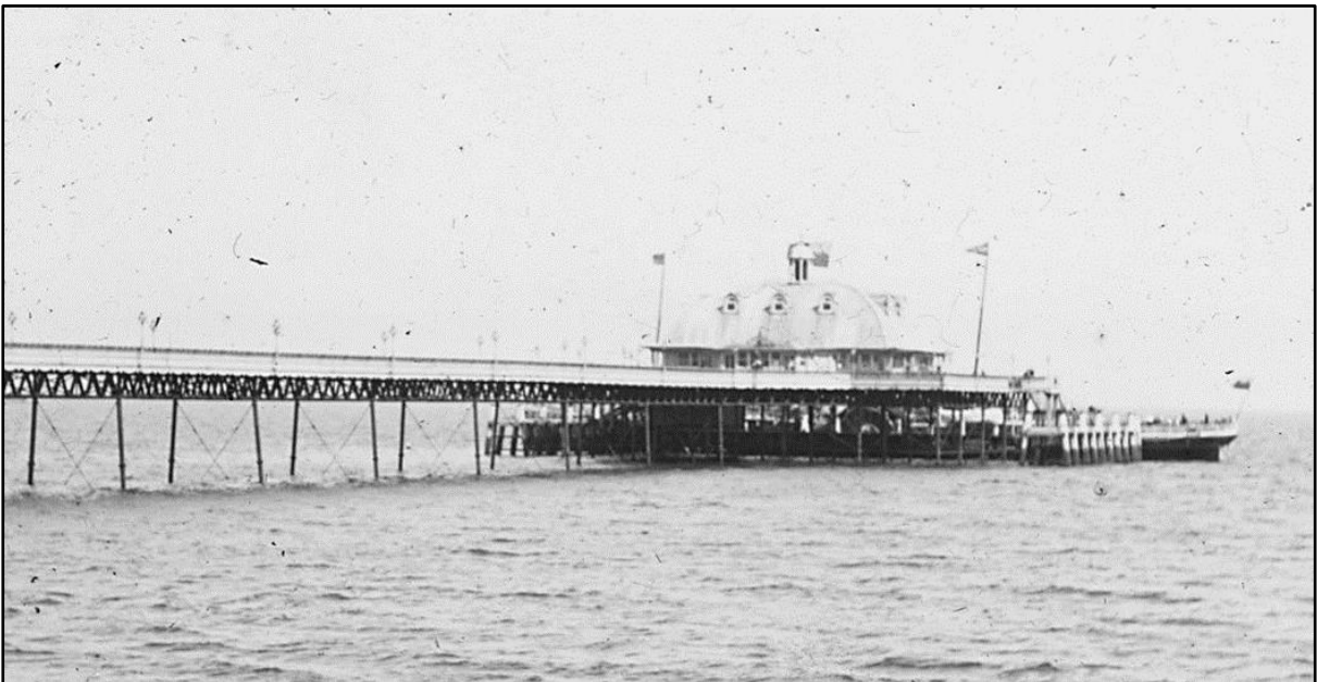
A view of Sandown Pier that dates to post 1895 because the pavilion is complete. A paddle steamer is moored at the end of the pier. Circa. 1896-1910