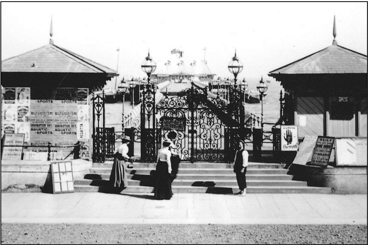
The entrance gates to Sandown pier. Circa. 1896-1914