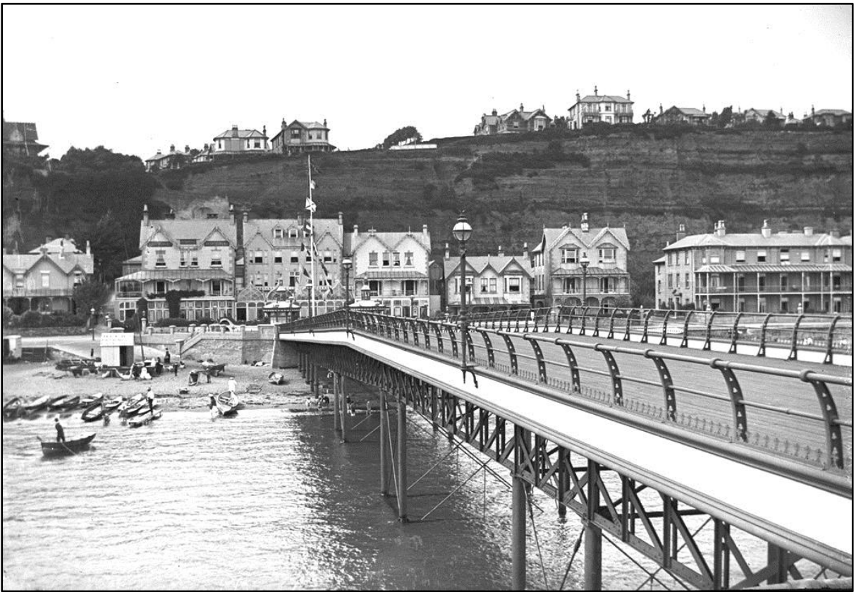
Shanklin - The Pier and Spa Hotel. Looking down Shanklin pier towards the Spa Hotel. Circa. 1890-1914