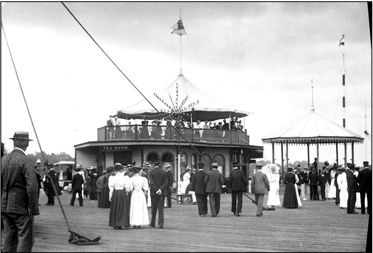
Ryde - The Pier Head. A view showing large crowds on the pier head at Ryde. Circa 1908