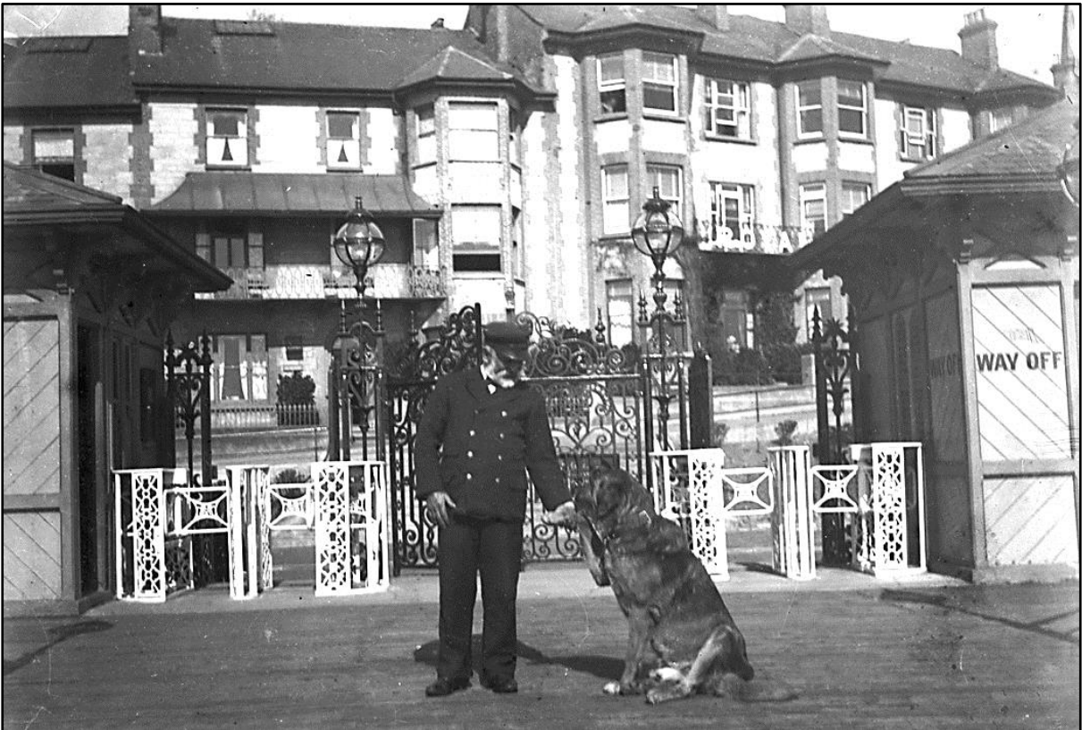
The Sandown Pier master standing on the start of Sandown Pier with his dog. Circa. 1890-1914