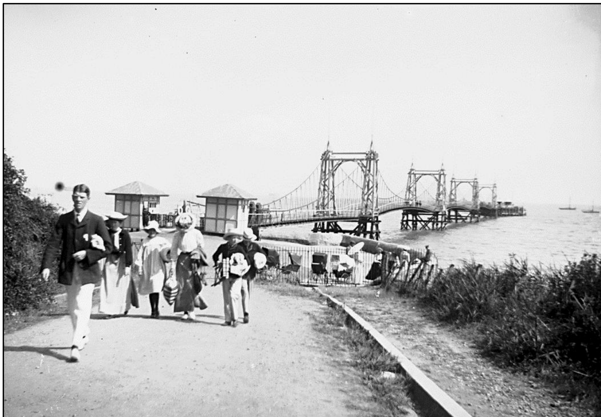
Seaview Pier. A group of people walking up the hill towards the camera with Seaview Pier in the background. Circa. 1900-1905