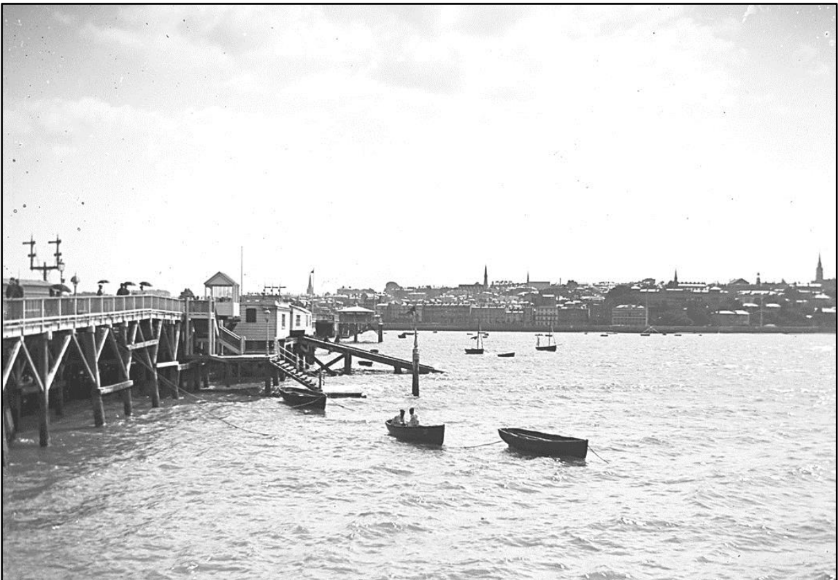
Ryde. A view of Ryde from the pier head. Rowing boats can be seen on the water. Circa. 1900-1914