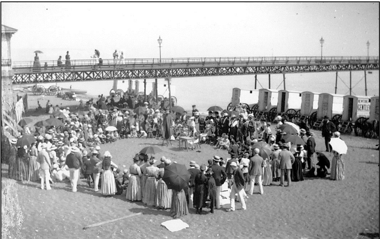
Sea-side amusements. Two people entertain the crowd below Sandown pier. Circa. 1890-1914