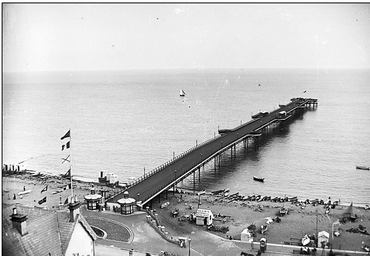
Shanklin - The Pier. Shanklin beach and pier from above. Circa. 1890-1914