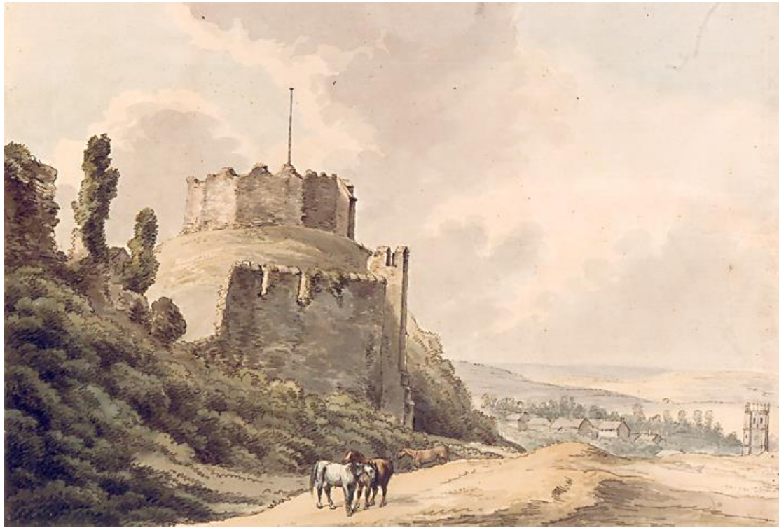
The Castle and Village of Carisbrooke. Samuel Howitt