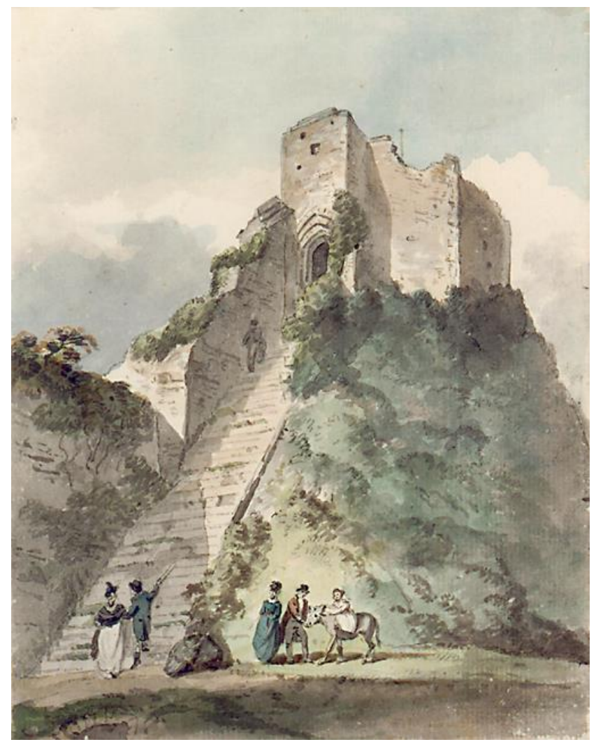
The Keep - Carisbrooke. Thomas Rowlandson

It is possible that separate views are being placed together.