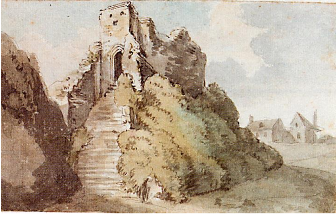
The Keep, Carisbrooke Castle, Carisbrooke. Thomas Rowlandson

This view shows the castle keep and the stone steps leading up to it.