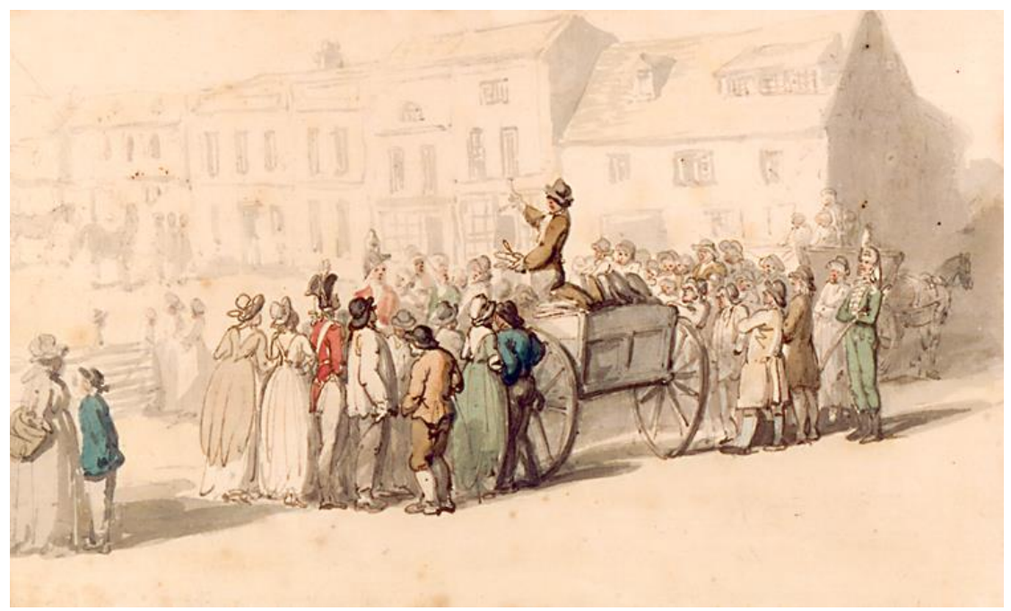
An auction in St James' Square, Newport. Thomas Rowlandson

This view from St Thomas's Square looks towards the Market House , an arcaded building with the Town Hall on the first floor. This building was replaced by the present Guildhall in 1815, built by John Nash .