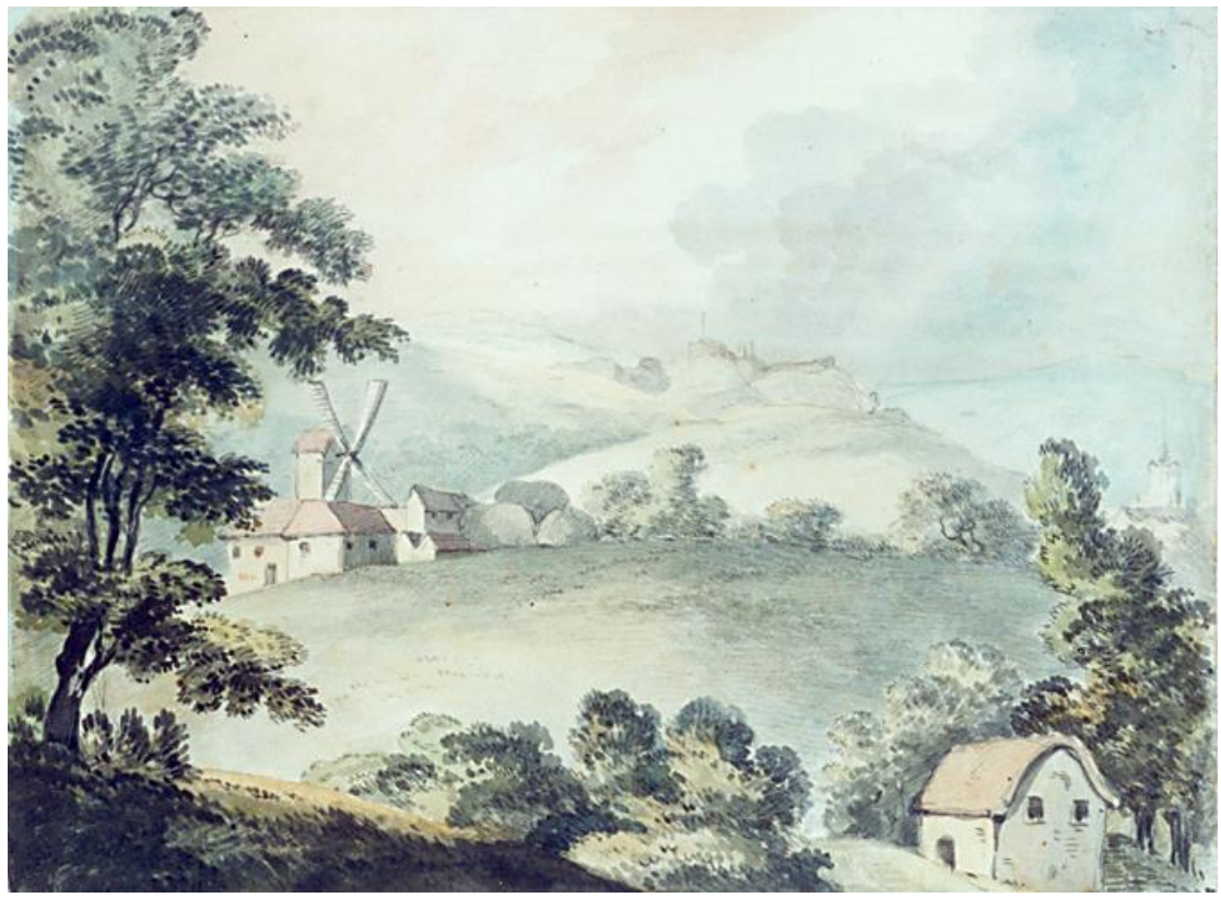
View on the road to Newport with Carisbrooke Castle in the distance. 1791 Circle of Thomas Rowlandson

The remarkably fine Perpendicular tower was built in the 15<sup>th</sup> century and is one of the finest on the island. The west window is now different from that illustrated in the painting.