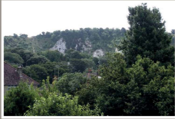
9. Shide Chalk Pit

House. Separate from the main house the observatory was recognised as the world's premier earthquake observatory until 1919 when the operation was transferred to Oxford University.