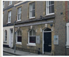
2. 30 Holyrood Street

you will come to Holyrood Street, which was formerly the main link between the town centre and Newport Railway Station, which was closed in 1966 and demolished in 1971.