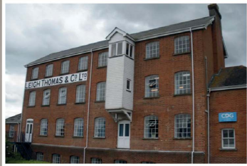
10. Pan Mill

We suggest that you walk up Burnt House Lane, where you will discover Shide Chalk Pit (9), which was quarried for chalk during the first half of the last century.