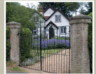
8. Shide Hill House

At the end of the path you come into Shide Road, to your right is the former Barley Mow (PH), now a popular restaurant, and opposite on the other side of the road alongside the shared use path that follows the former railway line, is the recently installed information board that gives detailed information about the life and work of Milne.