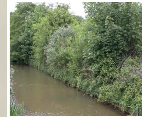
6 & 7. Shide Path

Road, where you may spot a rare surviving Victorian post box (4). This is a short road and then you meet Clarence Road (5), which is a typical late-Victorian residential area. Walk down the hill and you will come into Medina Avenue.