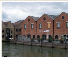
1. Quay Arts Centre

Your walk starts down at the Quay Arts Centre (1), an impressive community facility, where you will find artworks commemorating John Milne on a nearby car park wall. Then follow Sea Street and