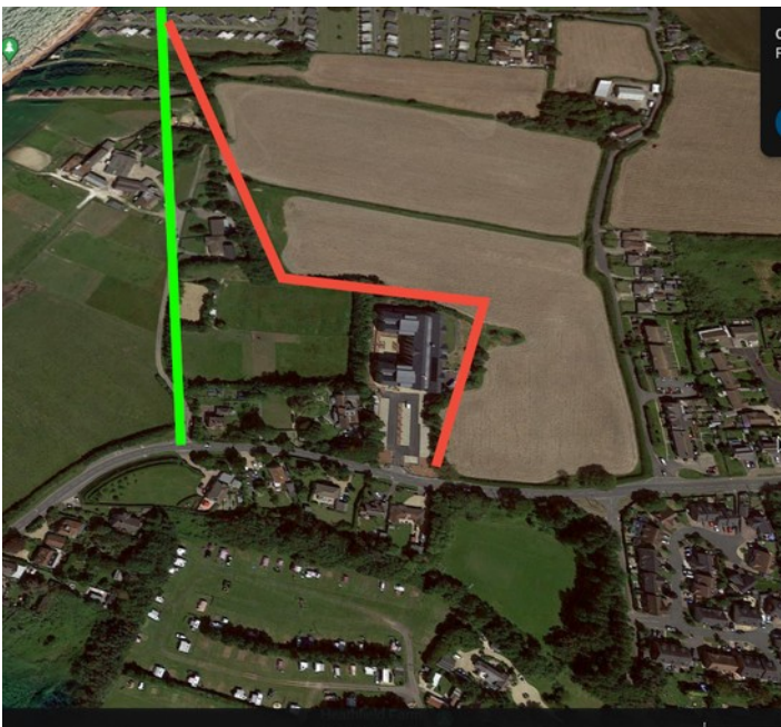
Image 2: showing Green Meadows care home. The green line indicates the proposed settlement gap boundary. The red line shows the proposed, this takes into account the houses along the road edge and the houses opposite when assessing whether the proposed location of the settlement gap is correct