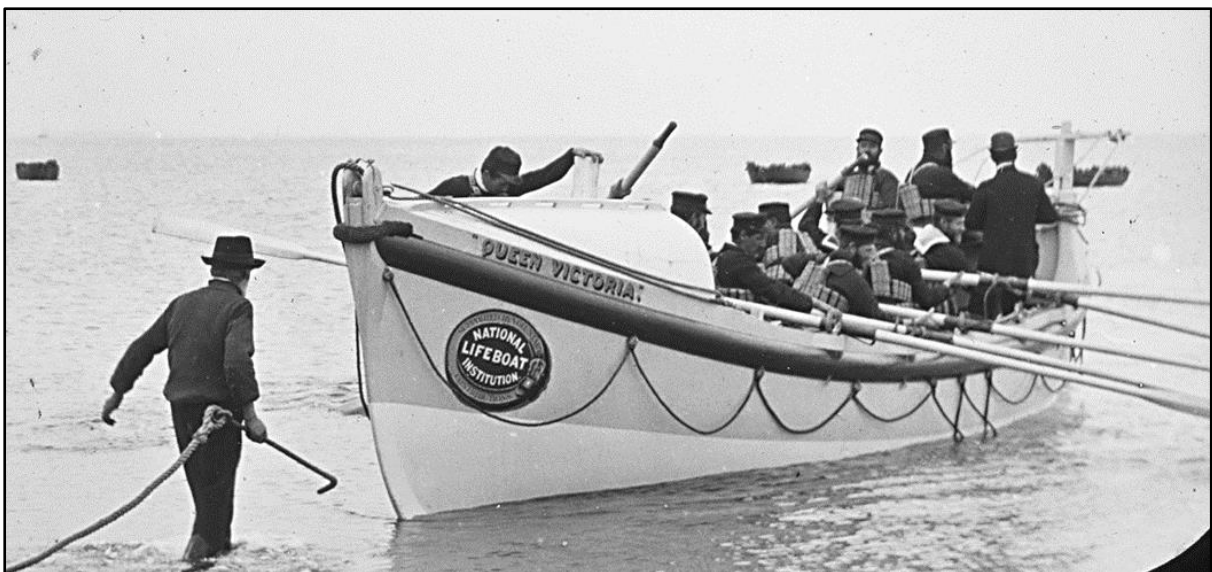
Lifeboat practise. The Bembridge lifeboat, Queen Victoria , coming back ashore after lifeboat practise. Circa. 1888-1902