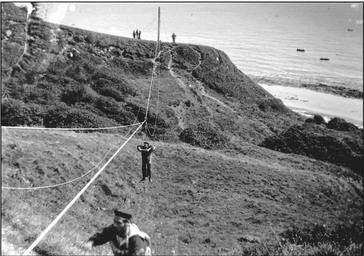
Coastguards training session with their rocket life saving apparatus. Circa. 1880-1914