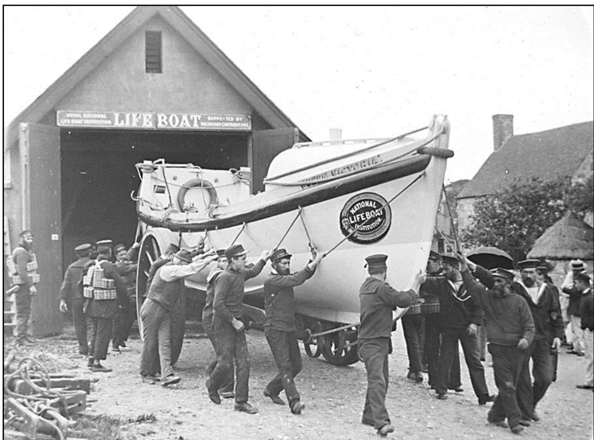
Lifeboat practise. The Bembridge lifeboat, Queen Victoria, is being pulled from the lifeboat house. Circa. 1888-1902