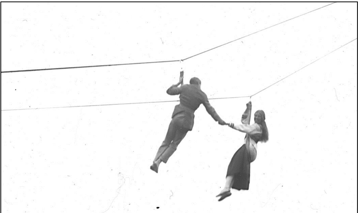
Double long rope drill 1913. Coastguard lifesaving practise with two ropes, a man is on one and a woman on the other. 1913

During an inshore sea rescue one of the most useful devices is something that can get a rope to a ship. The coastguards would fire a rocket with a rope attached to a vessel allowing crew and passengers to be hauled to land.