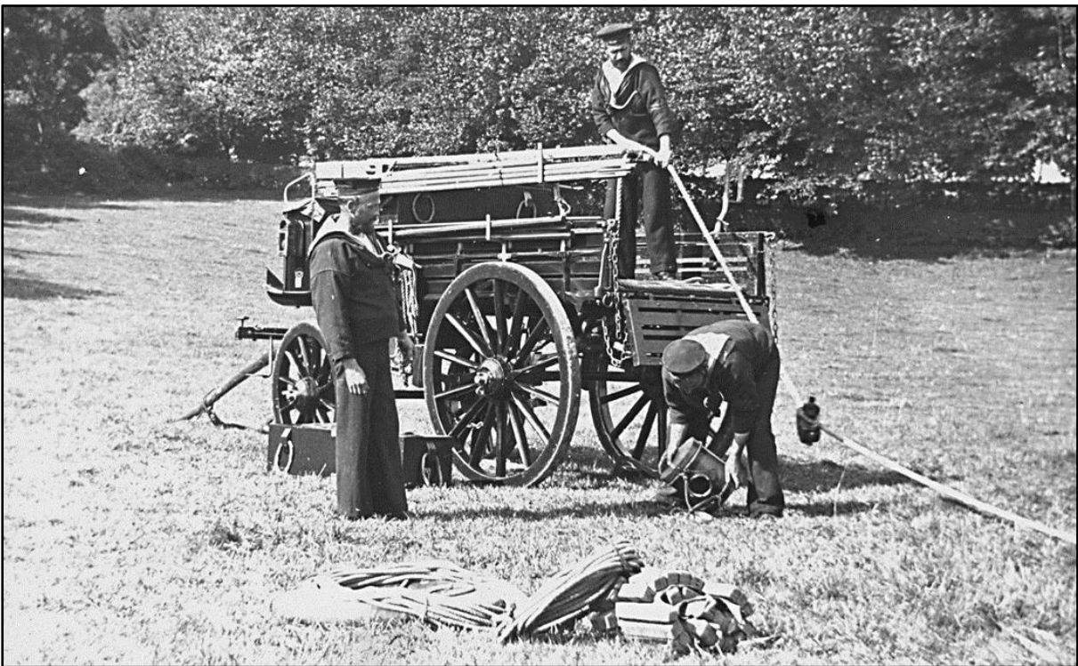
Rocket life saving practise - making up gear. Coastguards with their cart and equipment. Circa. 1880-1915