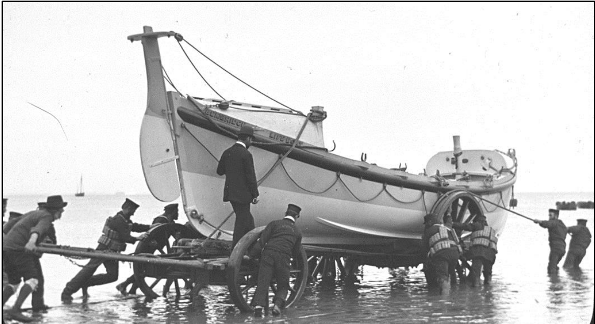
Stuck in the sand (lifeboat practise). The Bembridge lifeboat, Queen Victoria, is being wheeled down to the water's edge during lifeboat practise. Circa. 1888-1902

Abandoned, and in a derelict condition, she was purchased in 1989 and restored back to her original condition by 1998.