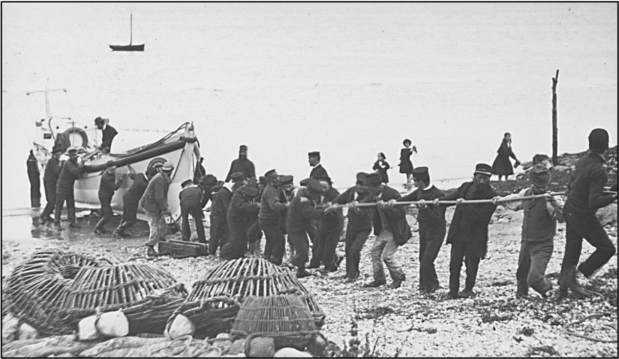
Lifeboat practise - hauling the Boat up. The Bembridge lifeboat, Queen Victoria, being hauled up the beach after lifeboat practise. Circa. 1888-1902