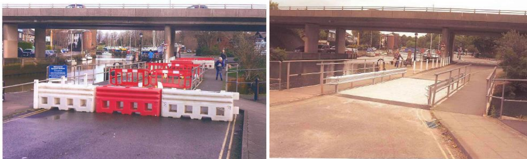
Sea Street bridge photos; closed and the new reopened structure

Visit Isle of Wight has withdrawn a leaflet called an IW beach guide for dog owners , as it is confusing, and they wish the IW to be dog friendly. The LAF won't make any official comment yet to Visit IW or IWC Beaches Officer as they will await the outcome of the forthcoming PSPO but members feel better on street signage would help.