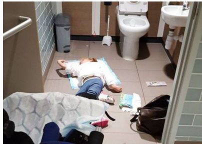
Normal toilet lacks room and facilities. No dignity for those who need to use it or the people who assist them.