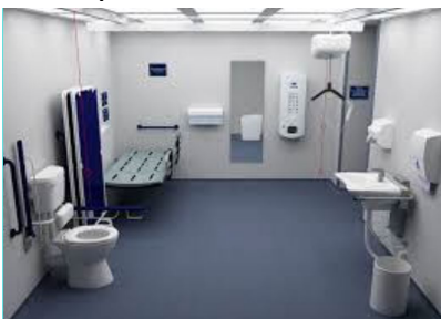
Well-designed changing place toilet

Public Toilets – Unpredictable opening times and a need for truly accessible changing places. A changing place toilet needs to be 3mx4m with an electric hoist (as big as a disabled parking bay) it will cost in the region of £35-40k but is money well spent