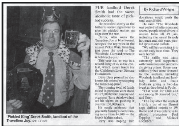
Another great charitable event the Annual Pickle War has raised over £30,000 for charity.