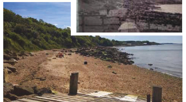
The rocky centre ground marks the site of the old coastguard boathouse

The main beach area, off the green and at the bottom of Shore Road, was, in its day, in the 60s, 70s and early 80s, a beach with a putting green, diving raft and paddle rafts that you could hire. Gurnard Sailing Club founded in 1931 as a working man's dinghy club, and has hosted Cowes Dinghy Week and several national championships. In 1996, the club was rebuilt with a Lottery grant, but it remains a self-help club offering high quality dinghy racing and is recognised for its long-standing contribution to the community.