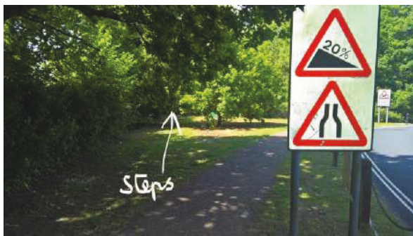
Steps and path down to the shore through the old clay pit