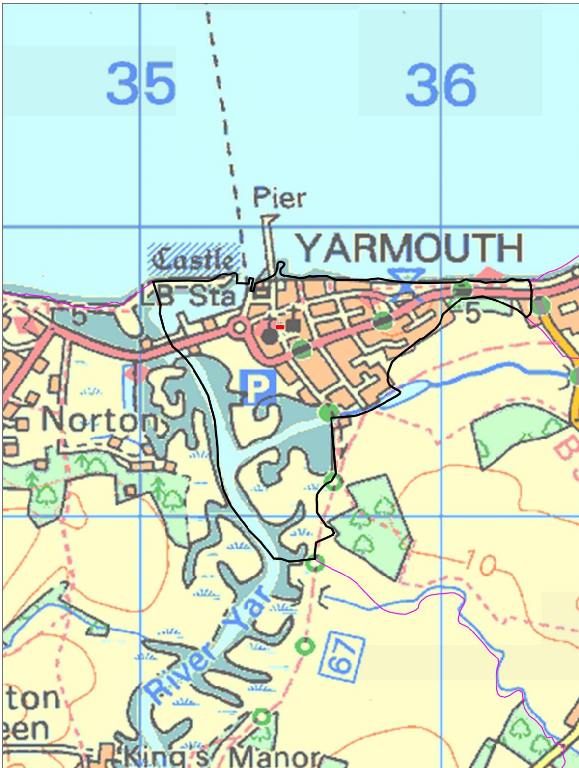
Map A – St James Parish