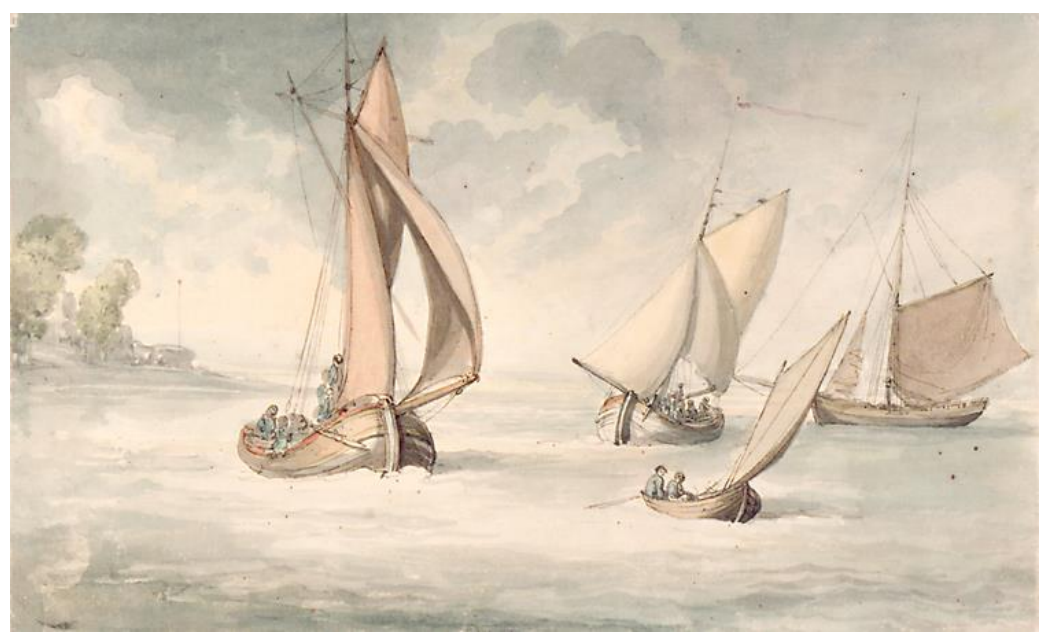
Cowes harbour; and Egypt near West Cowes. Thomas Rowlandson

This view shows the east bank of the River Medina with East Cowes behind.