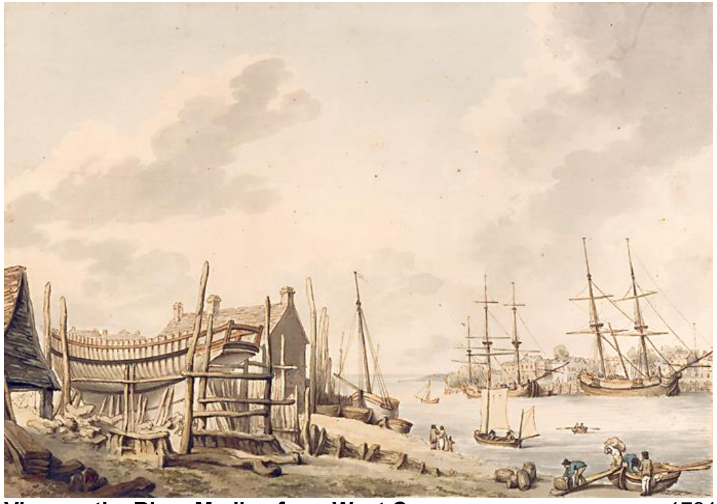
View on the River Medina from West Cowes. Samuel Howitt

This is clearly a view of the west bank of the harbour. Note the fishing nets hanging at the top of the wooden steps.