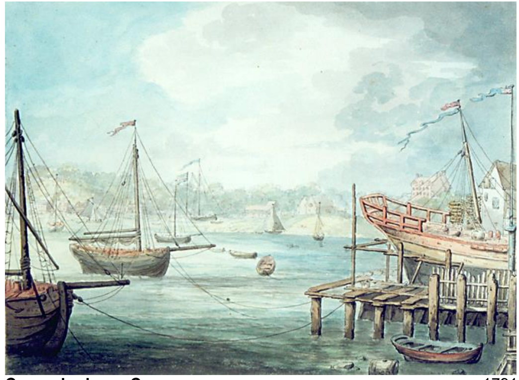
Cowes harbour, Cowes. Circle of Thomas Rowlandson

This view looks north east and depicts a ship-building yard at the south end of West Cowes . The view predates the arrival of White's shipbuilders who established their yard on this site.