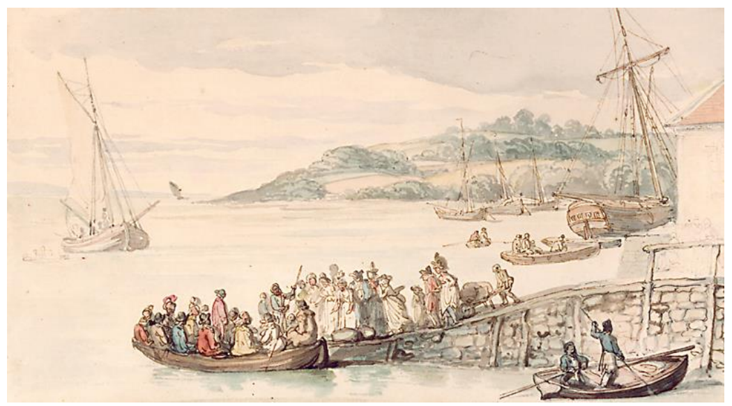
West Cowes landing. Thomas Rowlandson

In 1787/8 it had been put up for sale from the Mount Edgcombe Estate . The leaseholder was William Grossmith who had placed bathing machines on the shore between the house and Cowes Castle . The house was substantially altered in the 19<sup>th</sup> century.