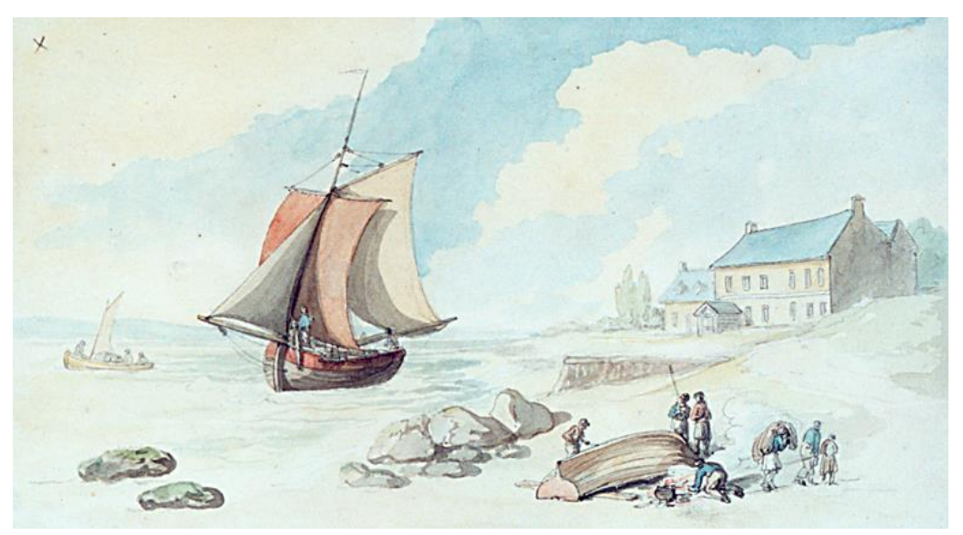
Egypt near West Cowes. Thomas Rowlandson