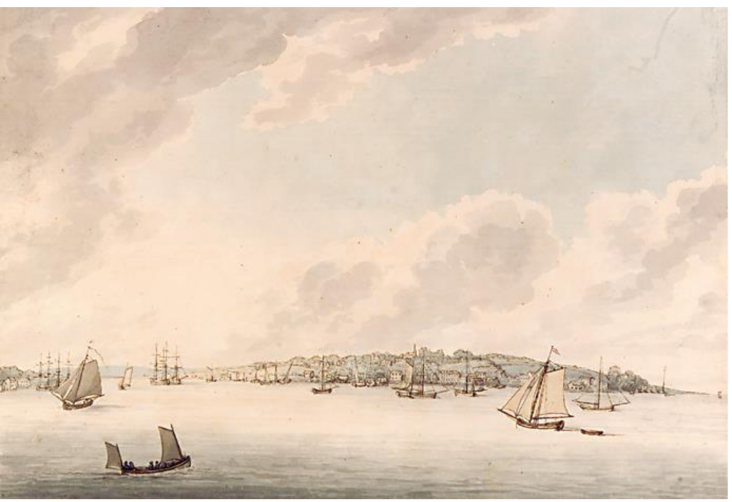
View of Cowes from the mouth of the harbour. 1791 Samuel Howitt IWCMS.2002.156

This view looks straight in at East and West Cowes from the Solent . East Cowes is on the left and Egypt Point to the far right.