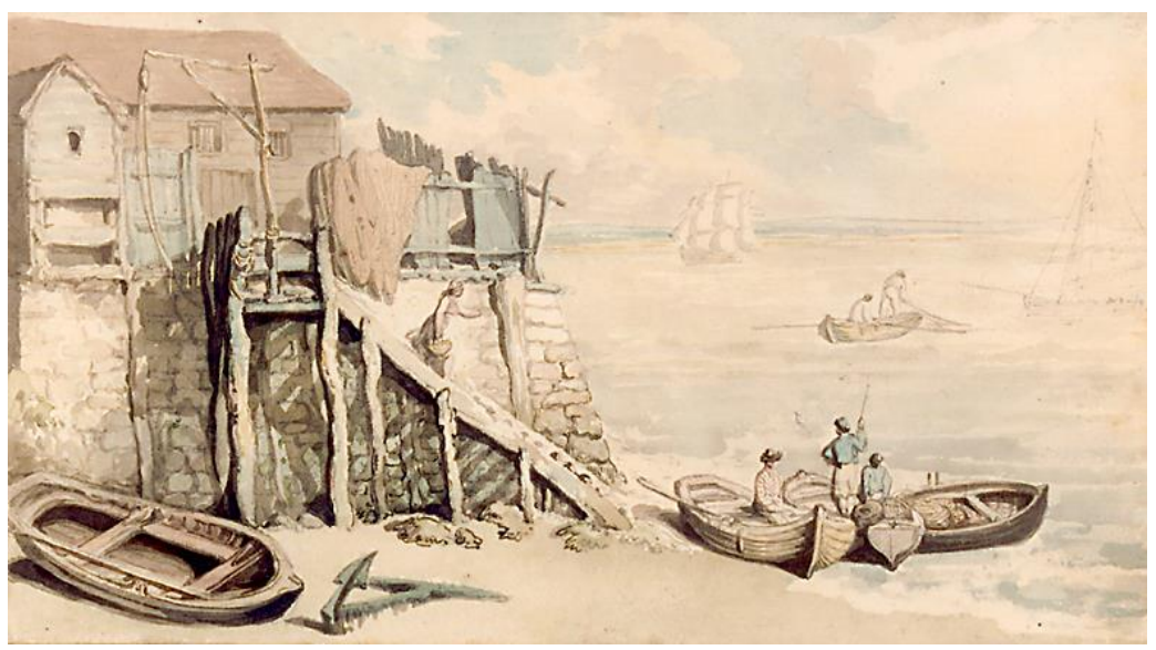
Cowes Harbour, Cowes. Thomas Rowlandson

This view shows maintenance work being undertaken on a number of boats and some interesting details of the buildings along the West Cowes sea front.