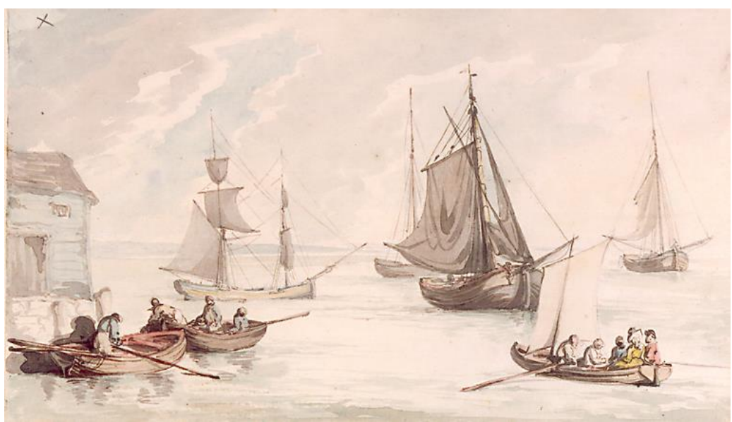
Cowes harbour. Thomas Rowlandson

This view looks straight in at East and West Cowes from the Solent . East Cowes is on the left and Egypt Point to the far right.