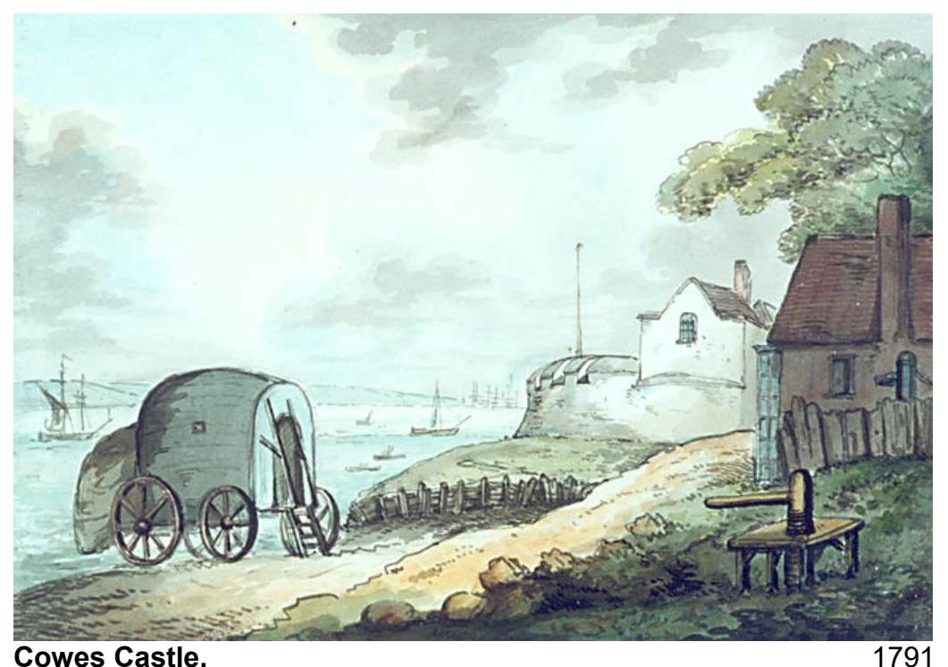
Cowes Castle. Circle of Thomas Rowlandson

The land on the far side of the castle became known as The Parade following a review of the troops in 1798. The area was also popular with bathers around 1800 and was used for reasons of health and pleasure, which is reflected by the presence of the bathing machines.