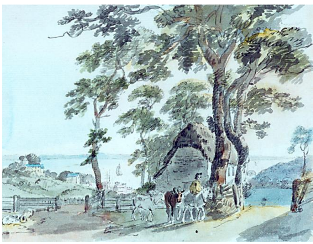
West Cowes. Circle of Thomas Rowlandson

The gable to the west is Bellevue, the predecessor to Northwood Park.