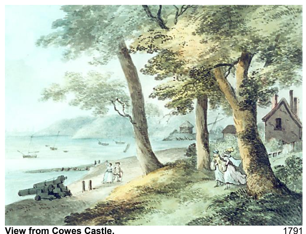
View from Cowes Castle. Circle of Thomas Rowlandson