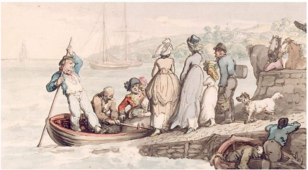
West Cowes landing. Thomas Rowlandson