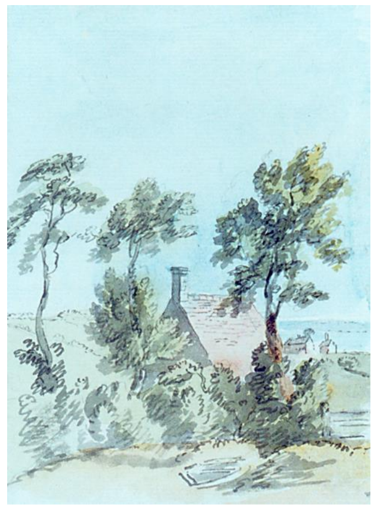
West Cowes. Circle of Thomas Rowlandson