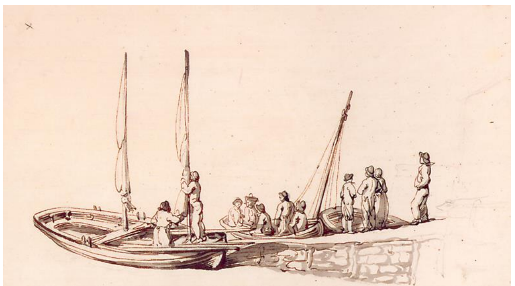
West Cowes landing. Thomas Rowlandson

Many boatmen made their living from transporting people and cargo to and from the larger ships gathered in Cowes Roads waiting for a convoy, for fair wind or fair tide, to clear Customs or to receive orders on where to proceed to sell a cargo. Cowes , too, was often the last victualing point for ships setting off from England .