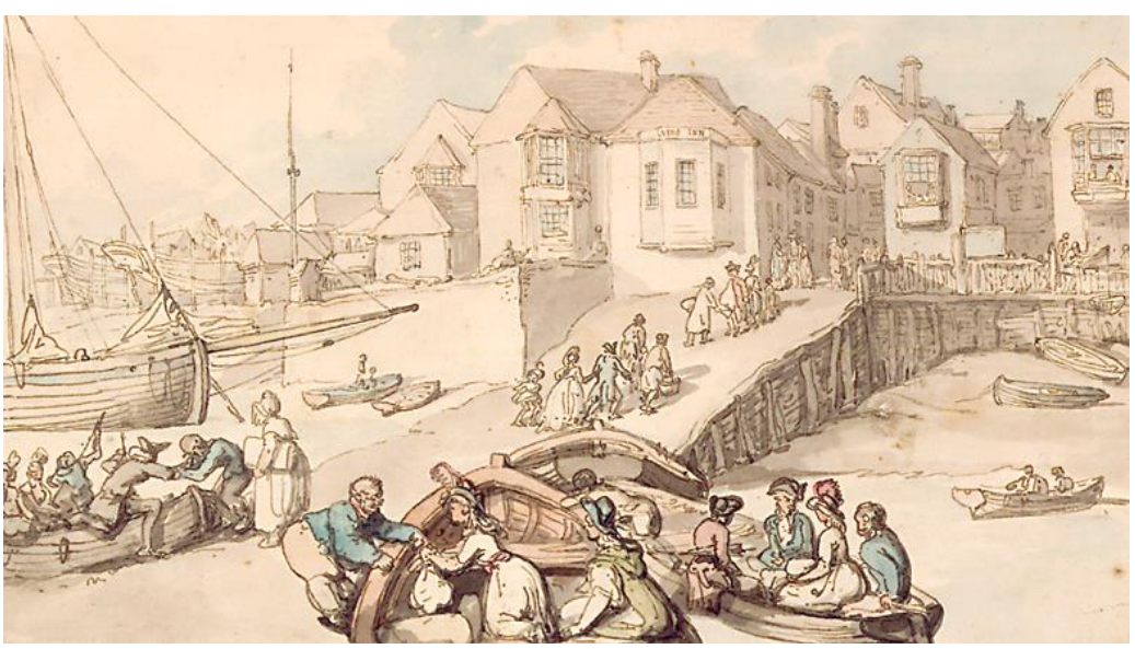
The Vine Inn at Cowes. Thomas Rowlandson