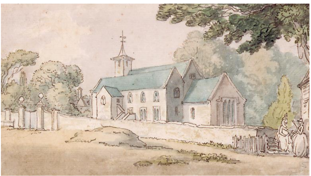
St Mary's Church, Cowes. Thomas Rowlandson

The Parade changed enormously in the 1790's. The Brannon prints of the 1820's show a handful of villas behind the walkway each lying in a tree filled garden.