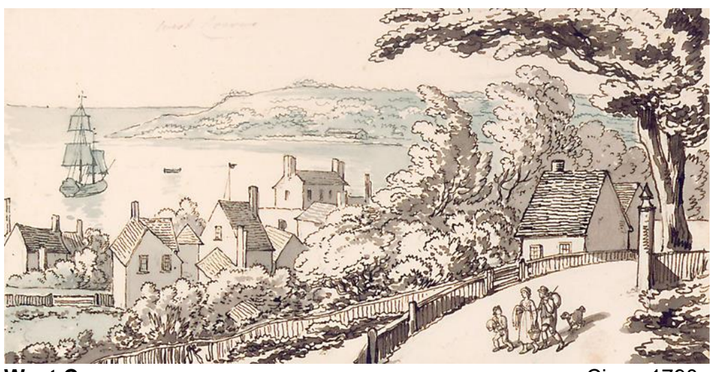
West Cowes. Circle of Thomas Rowlandson