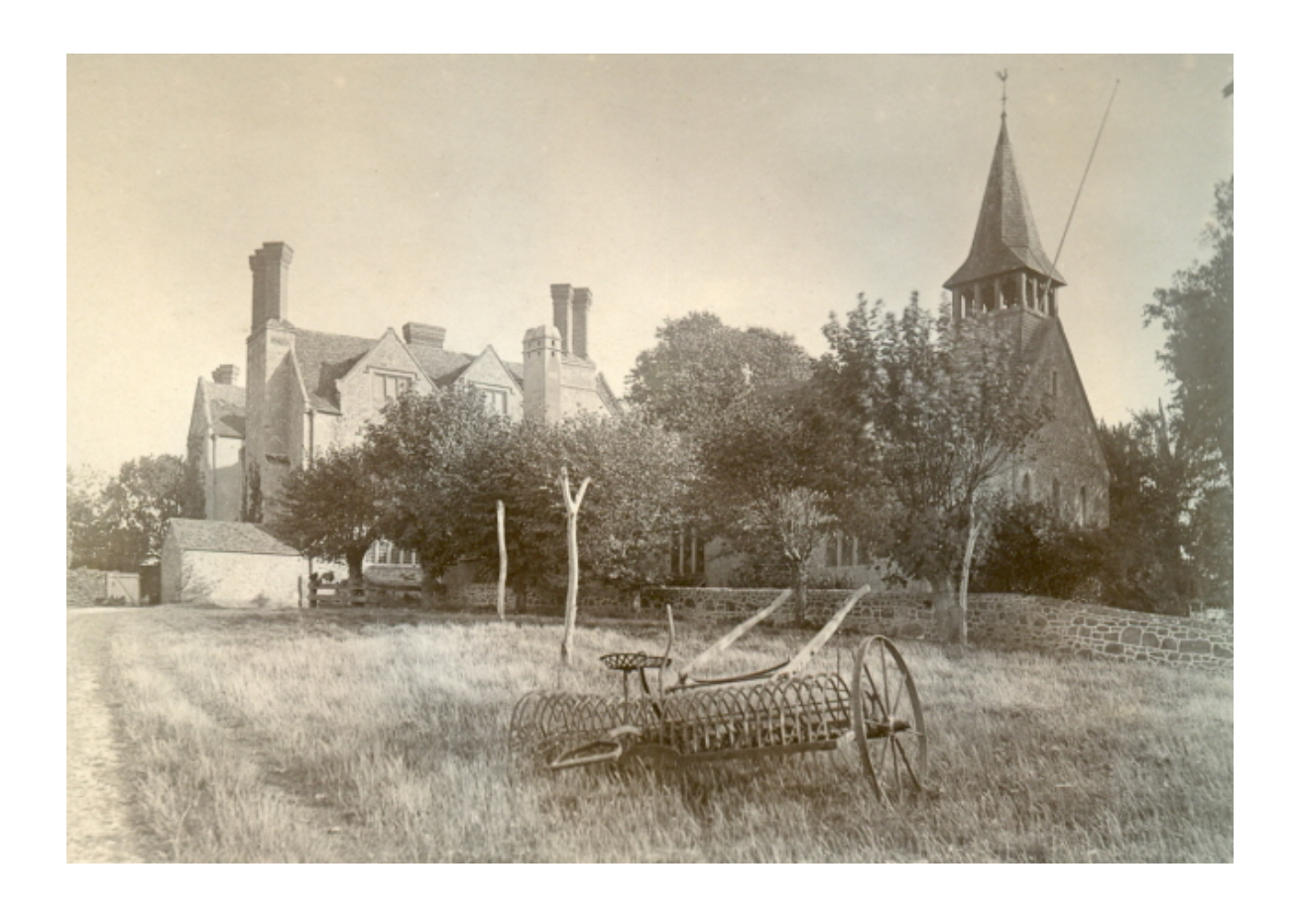
Yaverland (near Sandown) Manor House and Church 20/9/1897 Illustrations Collection Reference: Volume uncatgalogued