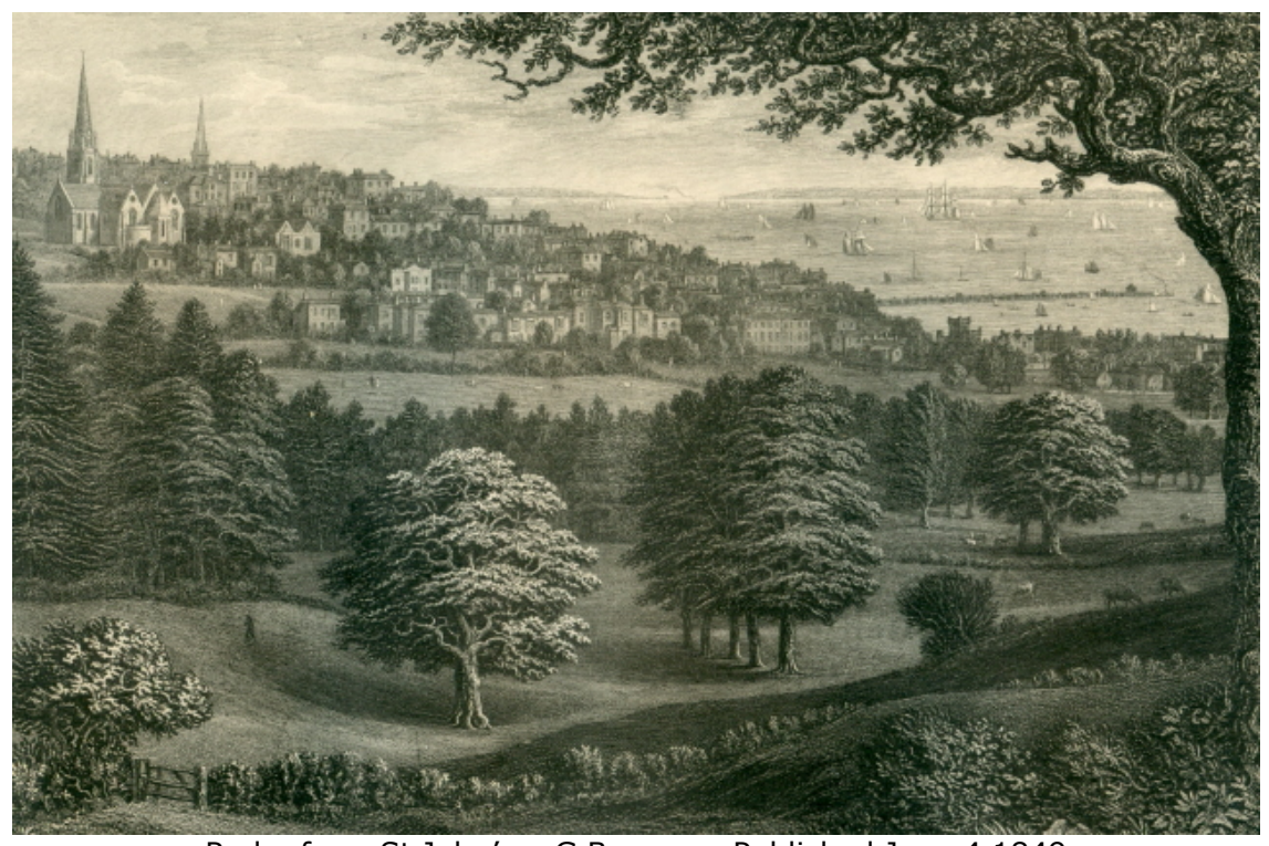
Ryde, from St John's – G Brannon. Published June 4 1849 Holy Trinity is the nearer church, with St Thomas' to the right.

Illustrations Collection Ref: RYD Uncatalogued