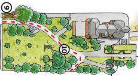
CHURCH LITTEN PARK (DETAIL)