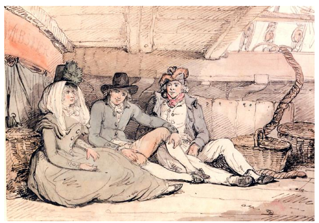
Below deck on the Lymington passage boat. Thomas Rowlandson

The passage between Lymington and Yarmouth has been much used since medieval times. For centuries such transport was provided by small privately owned boats. Henry Wigstead is believed to be at the tiller.