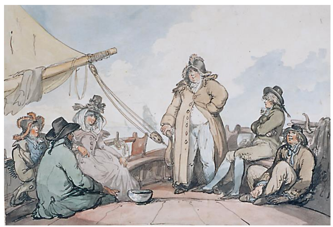
The quarter-deck of a Lymington passage boat. Thomas Rowlandson