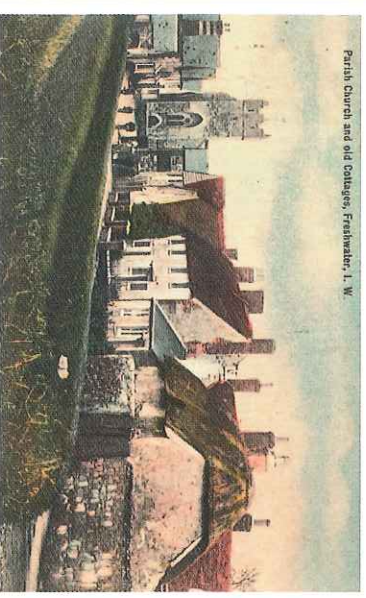
Parish Church and old cottages, Freshwater, I. W.

A circular walk round old Freshwater Village