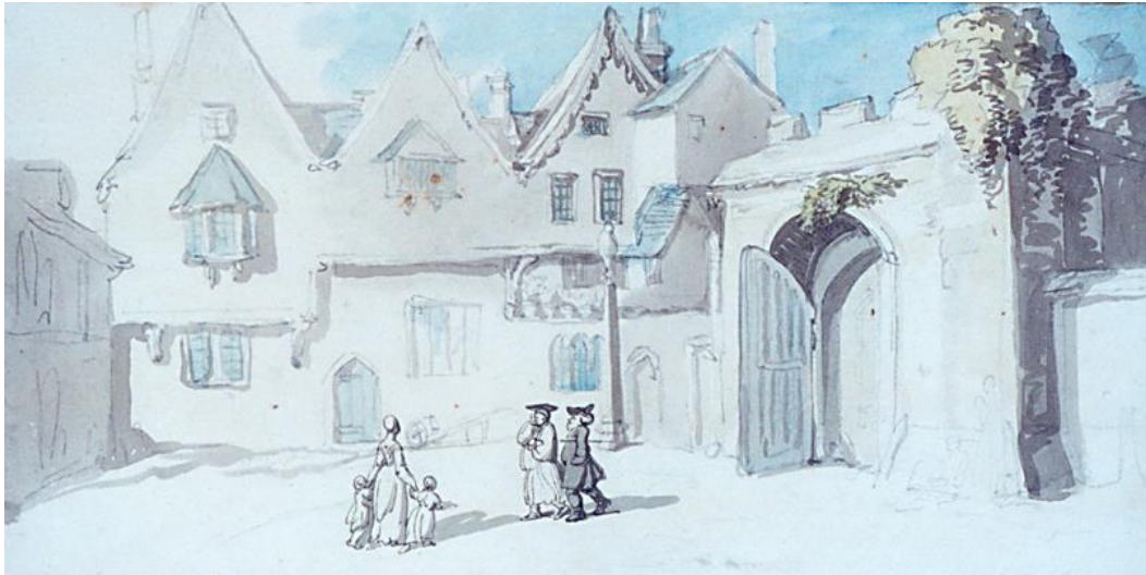
Cheney Court, Winchester. Thomas Rowlandson

This shows the Westgate looking eastwards into the city. A small part of the medieval church of St Mary-in-the-Ditch is showing just to the left of the smaller of the two arches.