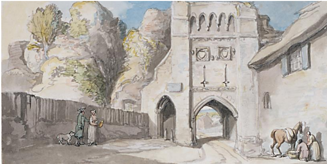
The Westgate, Winchester. Thomas Rowlandson

The Butter Cross (also known as the Winchester Cross the City Cross and the Market Cross ) in Winchester High Street . The Butter Cross is a holy cross, dating back to the mid-fourteenth century.