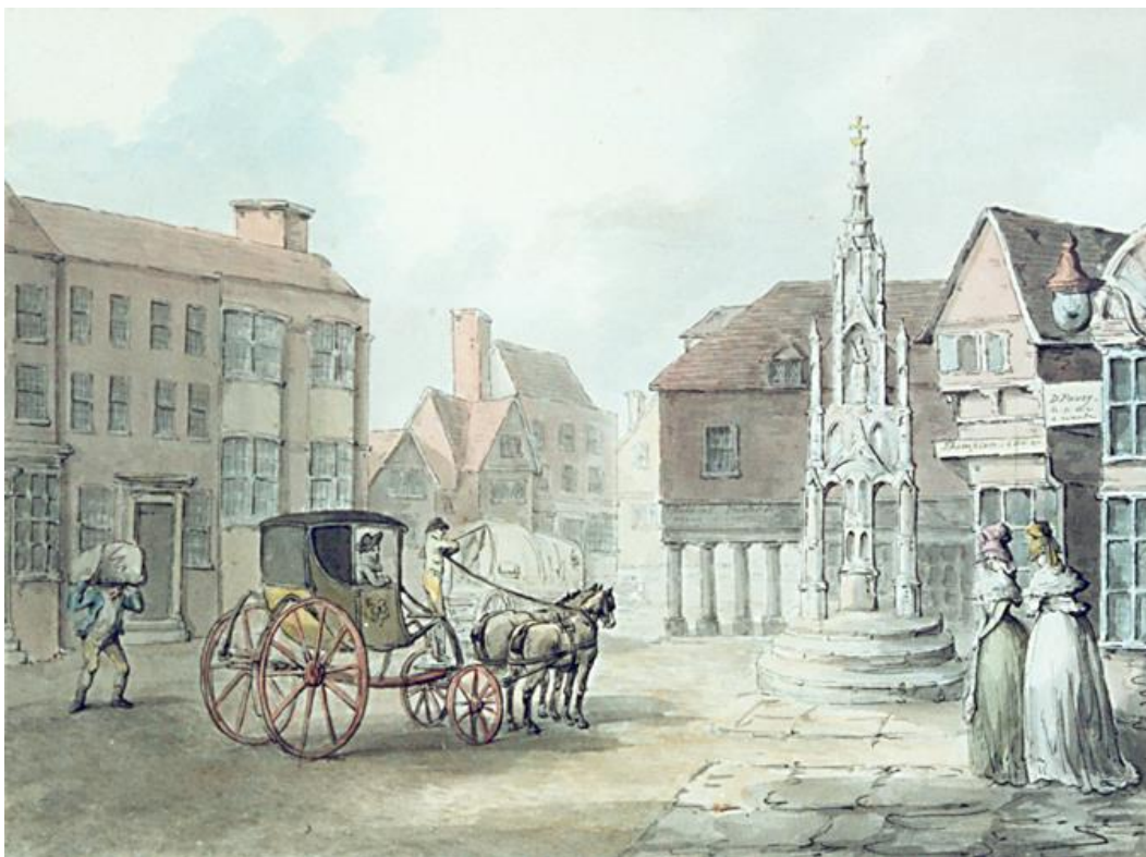
Winchester Cross. Circle of Thomas Rowlandson

This view shows an inn on Bagshot Heath . Rowlandson's party would have probably travelled this road to the south of England .