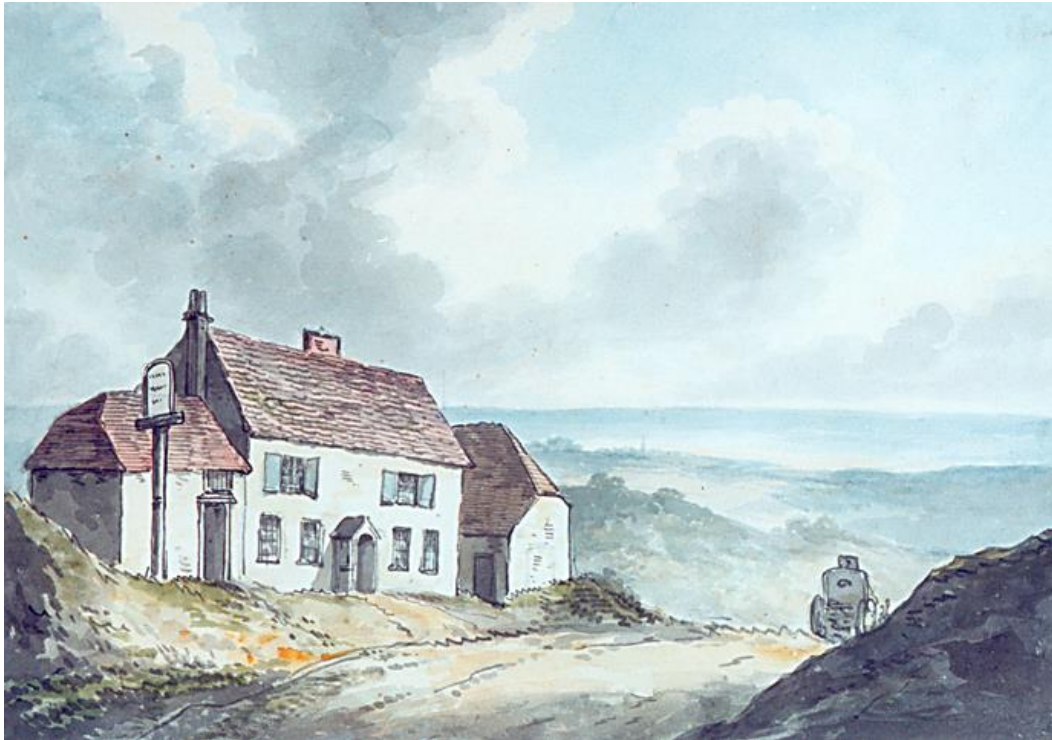
View of Bagshot Heath. Circle of Thomas Rowlandson