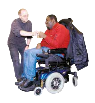
Living my life