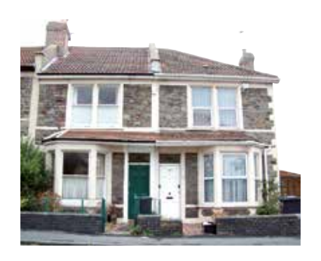
I live in a home that is right for me. I could have a tenancy agreement