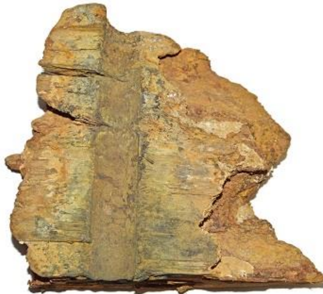
A timber sample from the wreck of HMS Pomone.