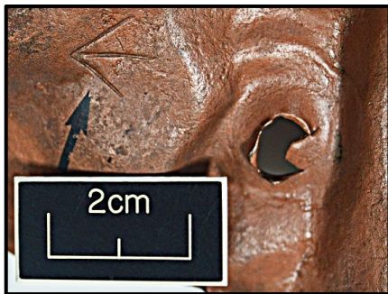
Copper sheathing with the broad arrow stamp of the Royal Navy.

Investigation of the site (Alum Bay 1) was undertaken by the Hampshire & Wight Trust for Maritime Archaeology (HWTMA). Copper rivets and a piece of copper sheathing from the underside of one of the large timbers near the bow were found to have the broad arrow stamp of the Royal Navy. This gave additional weight