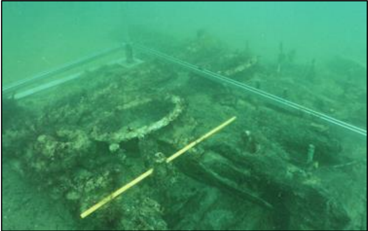
Hawse holes & bow structure of the Alum Bay wreck.

north. This suggests that some of the remains of HMS Pomone have drifted from The Needles into Alum Bay.