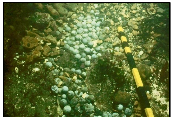
Lead shot resting on the sand of a Needles gully.

Over 3,000 items from the site have been excavated and recorded by the Isle of Wight Council's County Archaeological Service. Although no hull was found many artefacts lay scattered in the gullies around the site and are still being discovered.