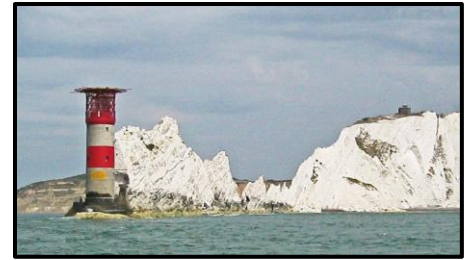
The Needles from the sea.

The chalk stacks of The Needles have proved to be the graveyard of numerous vessels over the centuries.