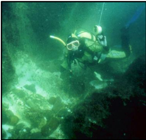
Diver on the Needles wreck site.