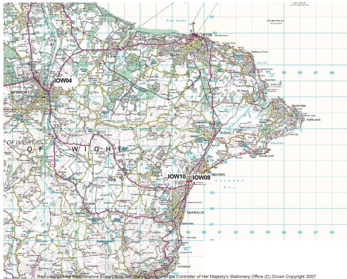
Map showing monitoring locations