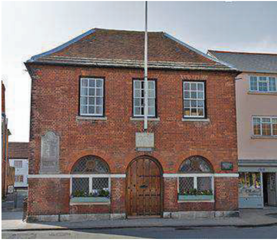
Yarmouth Town Hall

The Old Gaffers festival at the end of May has been running for some 20 years, and is a whole town festival, although currently running bi-annually, it is a festival that typifies the spirit of Yarmouth.