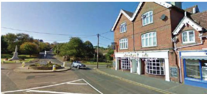
Totland Memorial Roundabout & The Broadway Inn

Crossing over to Queens Road, then turning to go along Clayton Road takes you to the T13, opposite the junction with Court Road, and leading into Colmar Way, with a left turn along uplands Road and right into Kendal Road onto The Broadway, Totland, where, just before the monument roundabout, is the former Broadway Inn, now Tea Rooms & Post Office, and which, in the time of Marconi was the Post Office of historical note.