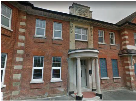
The Former Royal Standard Hotel

100yds back down School Green Road, just opposite the modern Sainsbury's, is the once celebrated Royal Standard Hotel, a former Burt's House, now sadly passing through successive hands, never fulfilling the promise of re-opening.