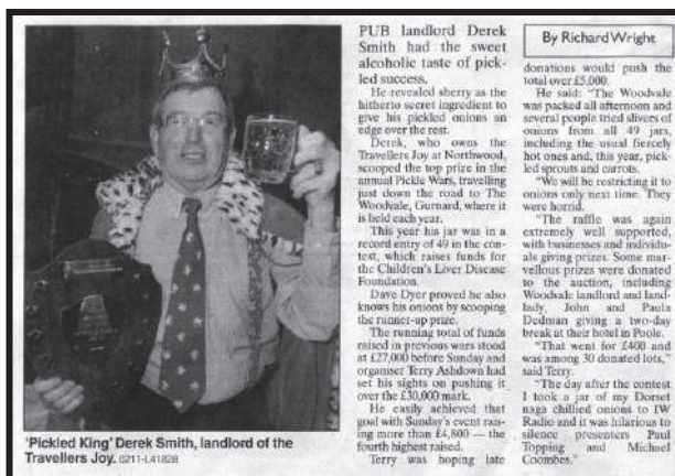
IW County Press - Another great charitable event the Annual Pickle War has raised over £30,000 for charity.