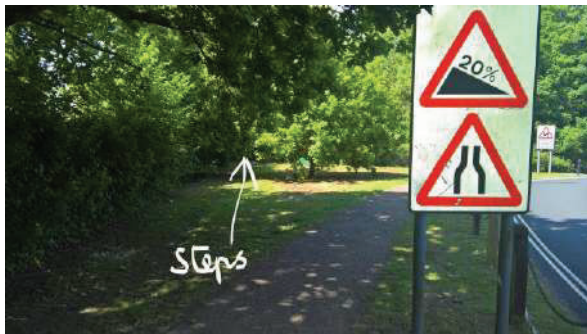
Steps and path down to the shore through the old clay pit