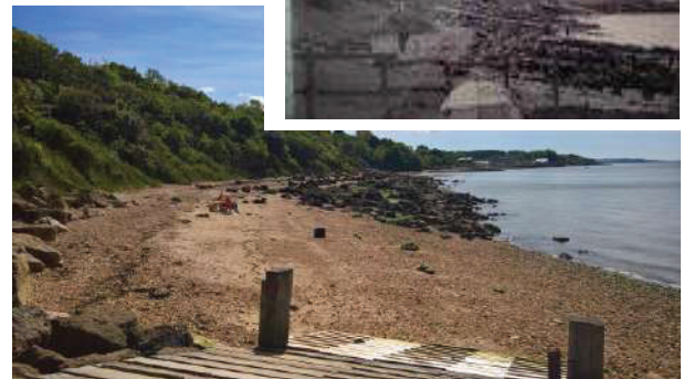
The rocky centre ground marks the site of the old coastguard boathouse

The main beach area, off the green and at the bottom of Shore Road, was, in its day, in the 60s, 70s and early 80s, a beach with a putting green, diving raft and paddle rafts that you could hire. Gurnard Sailing Club founded in 1931 as a working man's dinghy club, and has hosted Cowes Dinghy Week and several national championships. In 1996, the club was rebuilt with a Lottery grant, but it remains a self-help club offering high quality dinghy racing and is recognised for its long-standing contribution to the community.