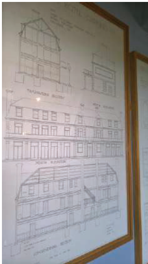
Francis Mew drawings on display in the Woodvale

Apart from the white box like 1 st floor extension the Woodvale has remained relatively unchanged externally since the 1930s.