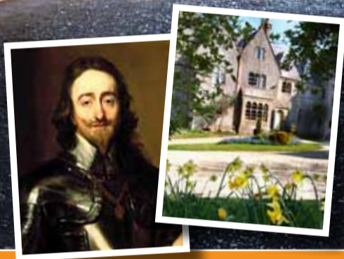
Meander from historic Newport to centuries-old Carisbrooke Castle, where King Charles I was imprisoned before his execution in 1648