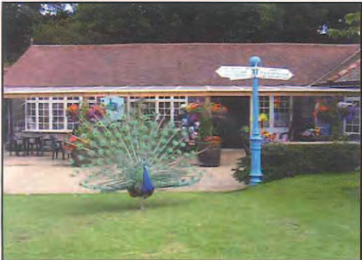
Cafe & Gift Shop

Visit the Water Mill Pottery where you can see our potters at work.