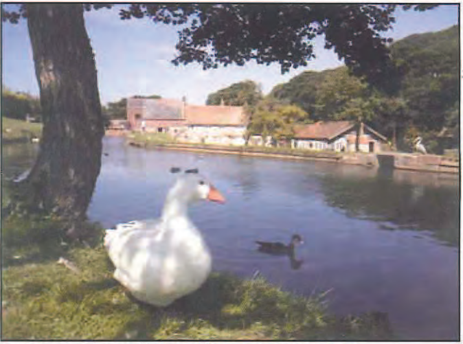
The only working Water Mill on the Isle of Wight

Milling is daily at 3pm during the summer season (except Saturdays). Set in 35 acres of stunning rural landscape, Calbourne Water Mill contains one of the oldest working water mills in the country, dating back to the Domesday Book.